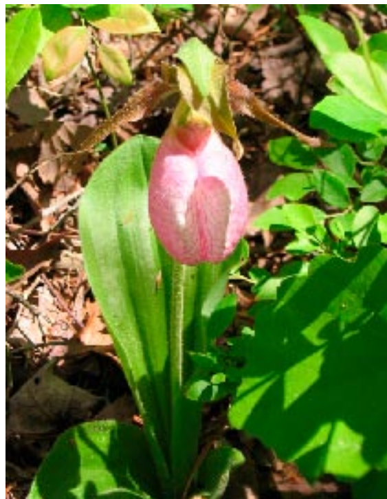
The rare Pink Lady's Slipper ( Cypripedium acaule )

tunities are developed through a number of sources including members, concerned citizens or news releases. Often, developers or landowners facing the inevitable destruction of plant life found on their property contact GNPS. Once a site has been identified, it is surveyed to determine the status of the existing vegetation.